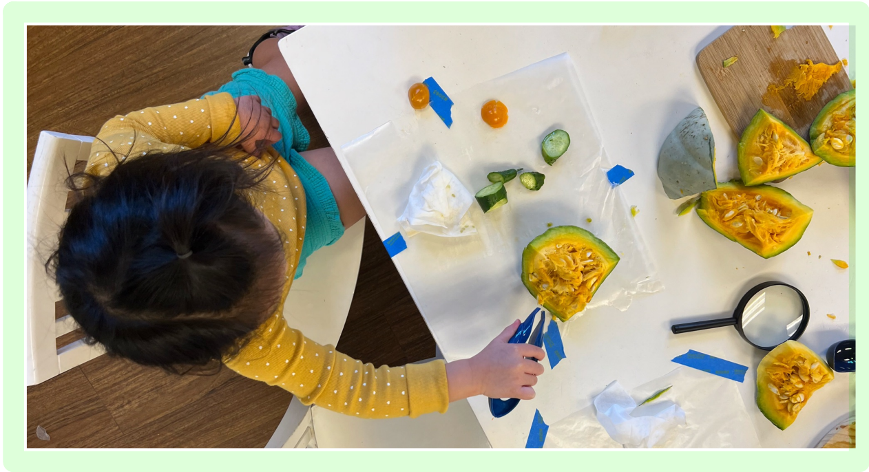
Lessons that encourage independence and foster confidence in various adaptive skills